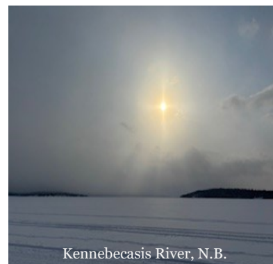
Kennebecasis River, N.B.