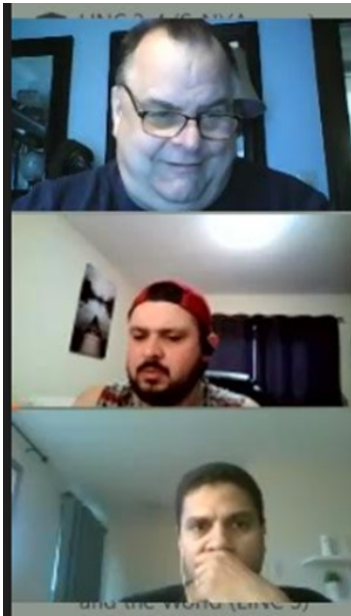
CCMA clients thriving despite pandemic challenges