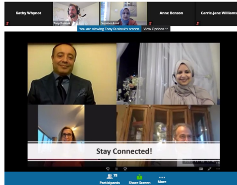
78 people learning & having fun together at the PechaKucha on Friday