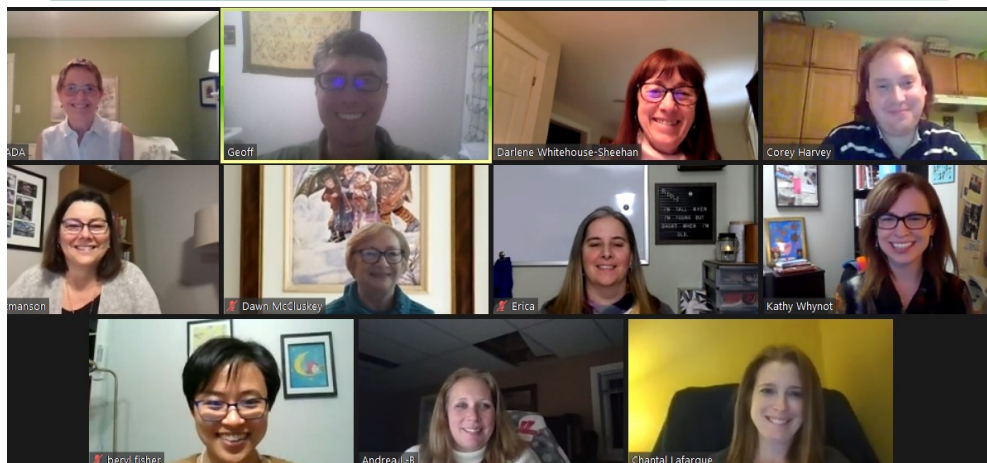
Your Board and members hard at work at the last general meeting