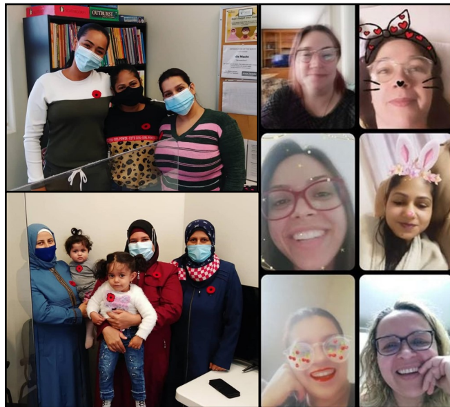
MAS clients thriving in language classes—whether live or on Zoom!

here without the support of our funders, partners, community members, volunteers, staff, and above all, our clients. We look forward to what the next year has to offer! Please reach out if interested in knowing more about MAS.