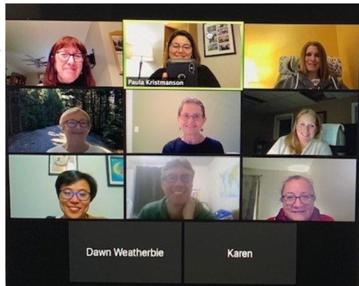
TESL NB members at the December 2020 meeting

We are pleased to be able to be able to provide these small donations to support initiatives aimed at food security. Thank you for your generosity and for helping TESL NB give back to our communities.