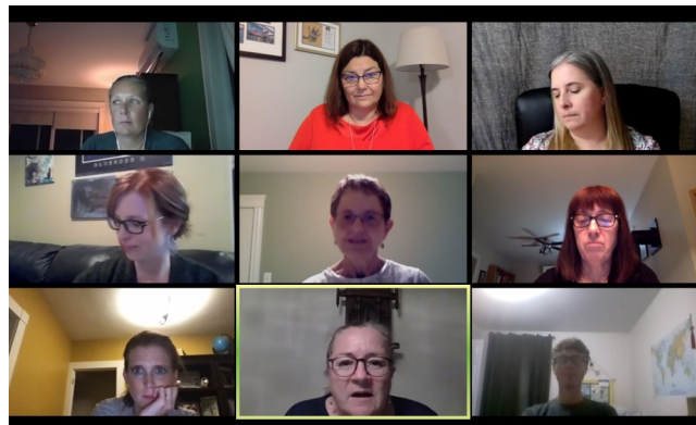
Some of the 2019-2020 TESLNB Board Members, shown here in an October 2020 virtual planning meeting